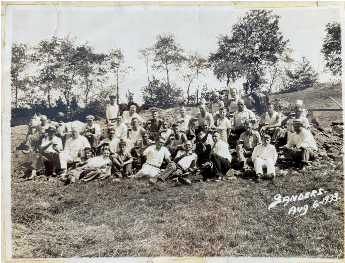
Post Members digging foundation for the Post 210 Building on North Street Doylestown.